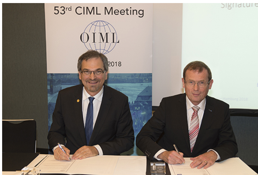
Signing of the renewed IEC-OIML MoU in Hamburg, 10 October 2018

The MoU between the IEC and OIML was signed but was not recorded. Delegates showed their appreciation with a round of applause.